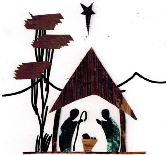
(Handmade card from St. Theresa School)

We have received a number of “Thank You” notes (and poster) from the agencies that our parish supported with our Tree of Sharing at Christmas, as well as notes from St. Therese School in Uganda. I continue to be humbled by your generosity and goodness as a parish, and am most grateful to be pastor here.